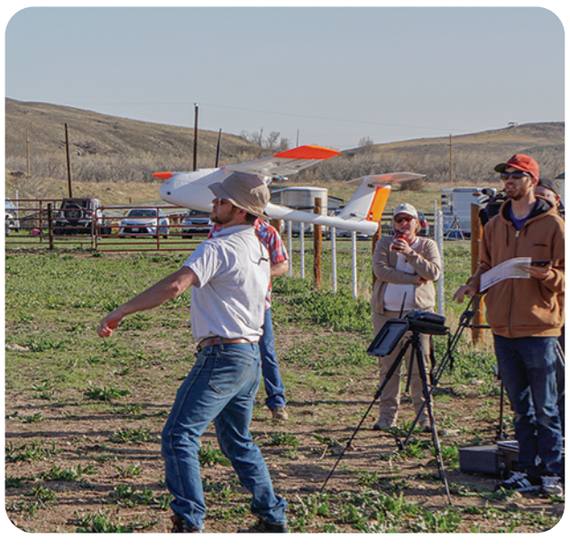
Available Flight Training

2650 East 40th Avenue Denver, Colorado 80205 Phone 303-384-3469 FAX 303-322-7242 www.leptron.com